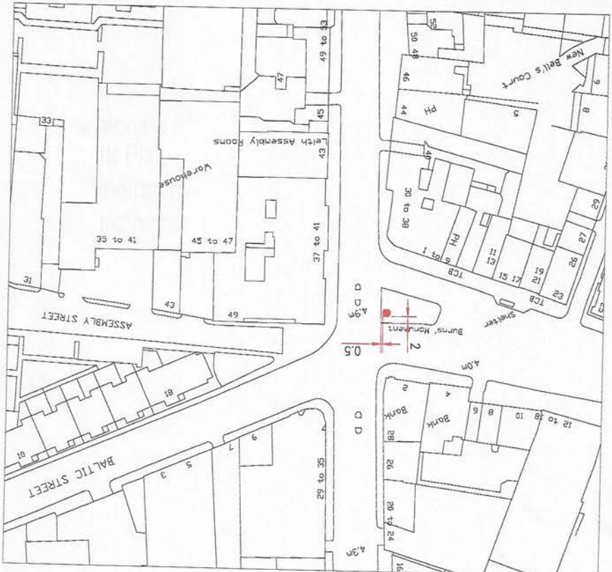
Existing Statue Location